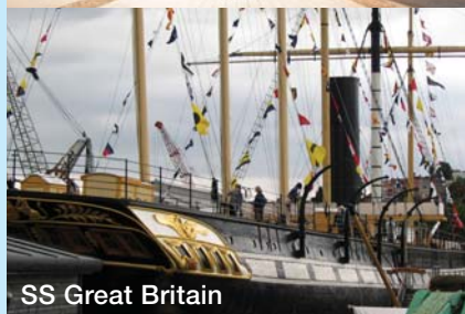
SS Great Britain